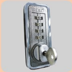
Real Keyless Lock