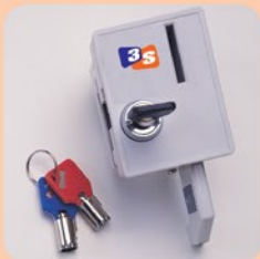
3S Coin Return Lock