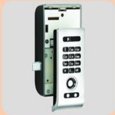
RFID (Digital) Lock