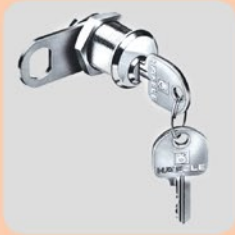
Cylinder Cam Lock